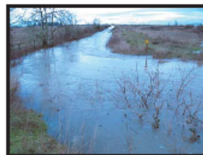
Lower Willow Creek looking north from 18th Avenue (following storm event)