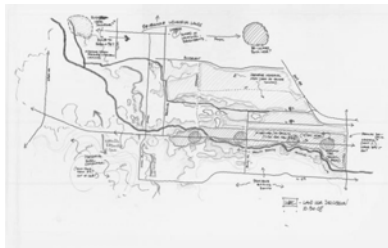
West Eugene Collaborative April 2007 – March 2009